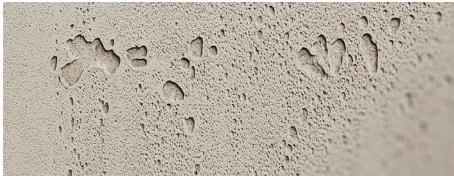
120 imi-beton smooth grey