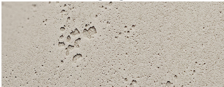
223 imi-beton vintage light