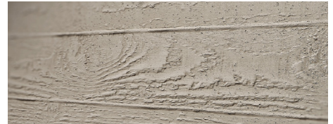
122 imi-beton timber formwork