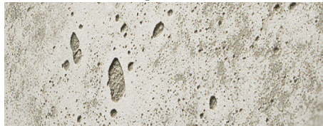
224 imi-beton vintage standard